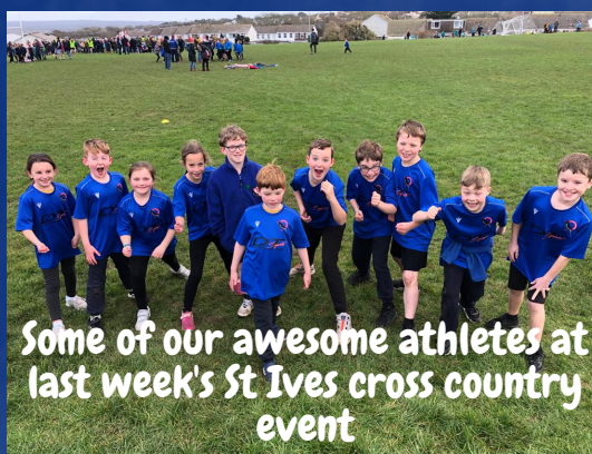
Some of our awesome athletes at last week's St Ives cross country event