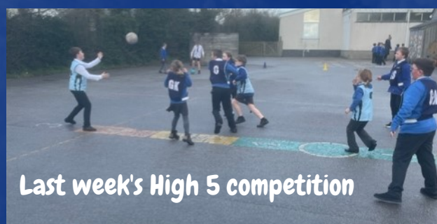
Last week's High 5 competition