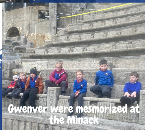
Gwenver were mesmerized at the Minack