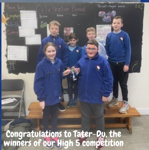
Congratulations to Tater-Du, the winners of our High 5 competition