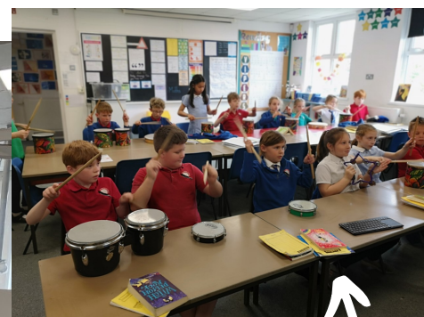
Nanjizal continued with their Music project with Mounts Bay