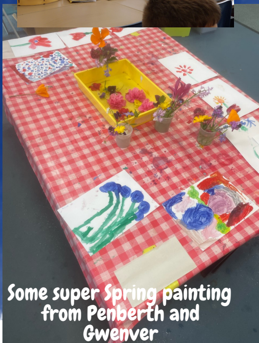
Some super Spring painting from Penberth and Gwenver

Remember to follow our MAT, Leading Edge, on Facebook