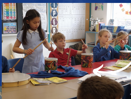
Nanjizal continued with their Music project with Mounts Bay