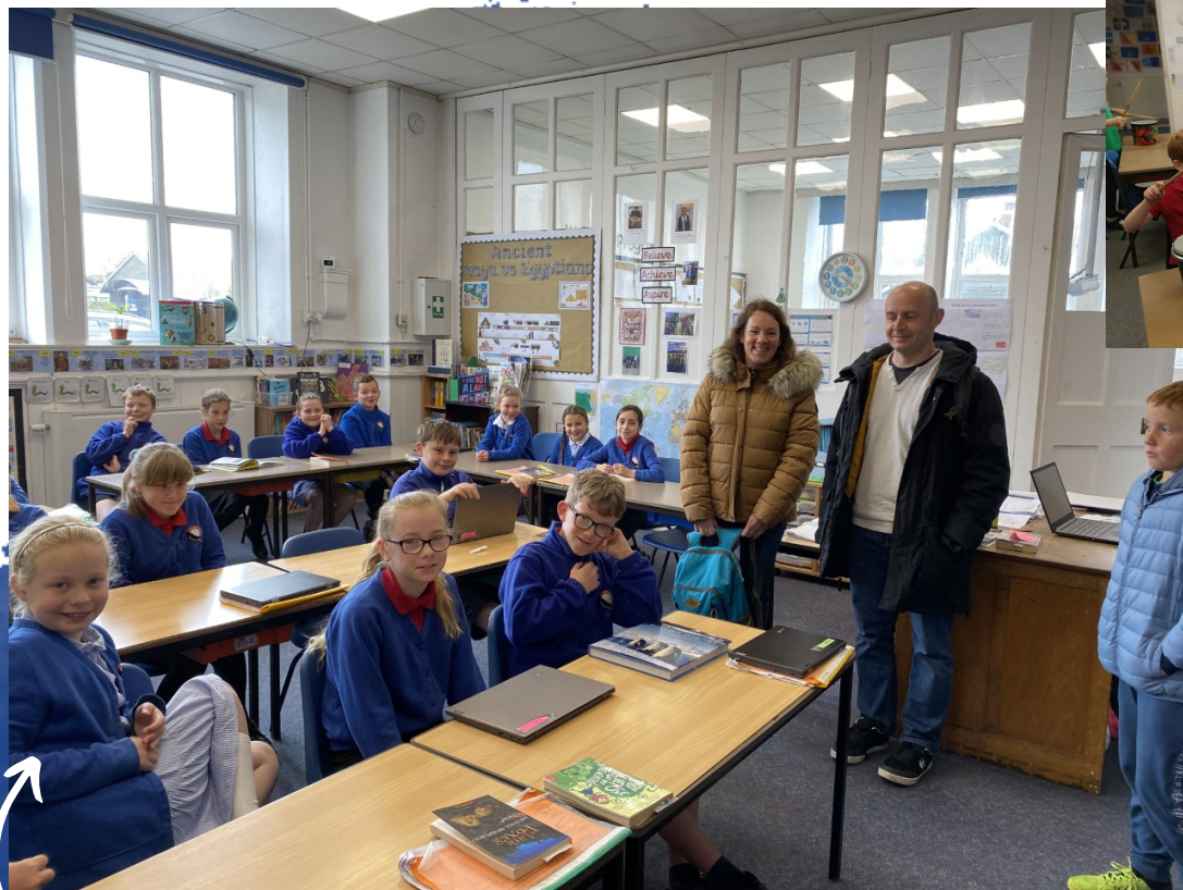
We were visited by friends from France and had the opportunity to practice their linguistics