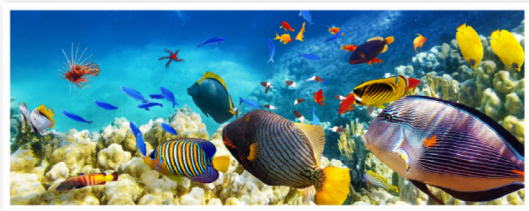
Tropical fish in a coral reef

Corals are marine invertebrates that live in large groups called colonies. Some species produce a hard exoskeleton that forms into a coral reef. The Great Barrier Reef, on the north-eastern coast of Australia, is the longest and largest coral reef in the world, with over 600 types of coral. Corals are at risk of being destroyed by climate change, pollution and consumers.