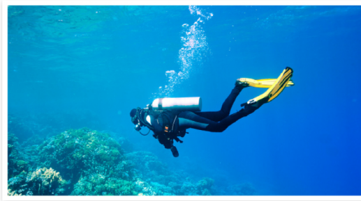
Deep sea diver using an aqua-lung to breathe

Ocean diving can be dated back to 4500 BC when people in the coastal areas of Greece and China dived for food. Cousteau's invention of the aqua-lung meant divers could take air with them, spending more time under the water and going deeper than ever before. Cousteau used the aqua-lung to explore and film the underwater world more freely.