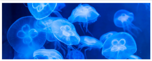
Jellyfish displaying bioluminescence

Some marine animals have chemicals in their cells that make light or bacteria that live on them and produce light. This is called bioluminescence. Bioluminescence can be used as defence, camouflage, to attract prey or to see in the dark. The most common colours of bioluminescence are blue, green and red.