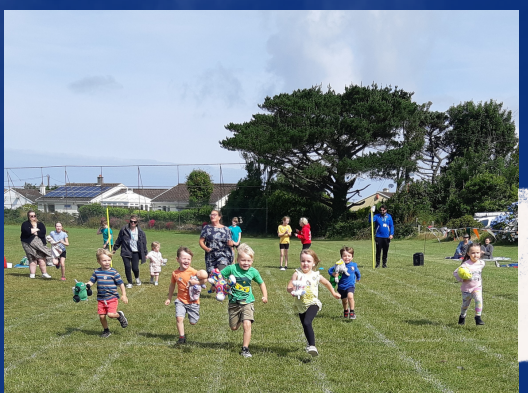
Sports' Day was great fun!