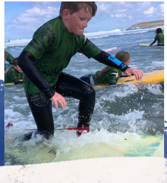
Porthcurno had a great time surfing today!