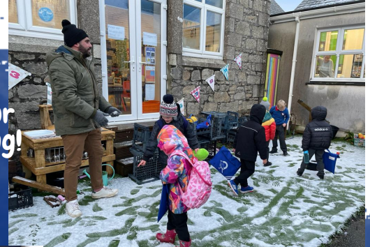
We loved our snow morning!