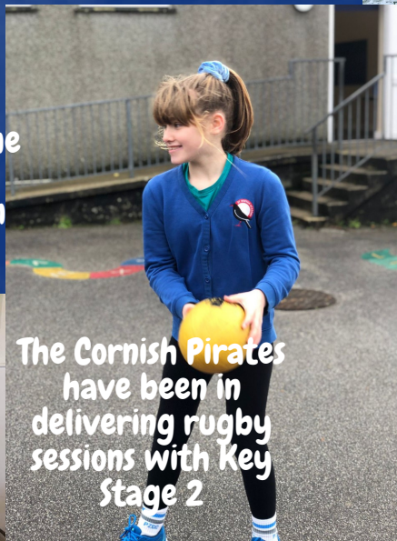
The Cornish Pirates have been in delivering rugby sessions with Key Stage 2