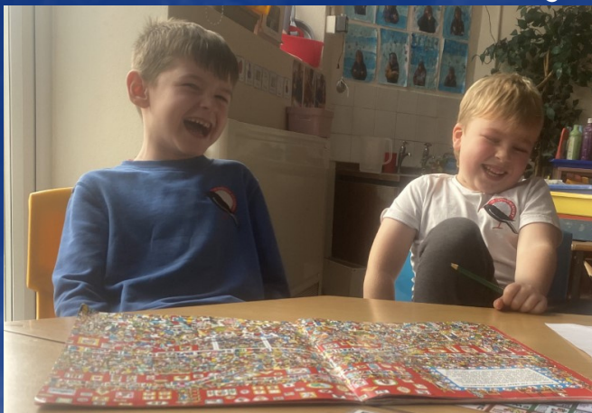
Year 1 and 2 loved reading club!