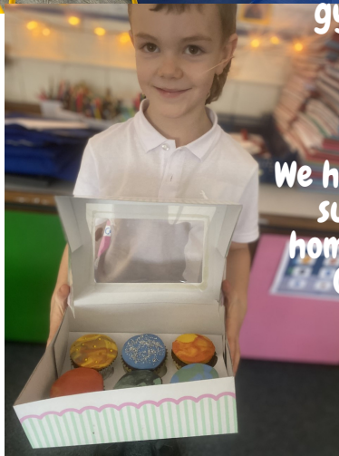
We have had some super space homework from Gwenver!